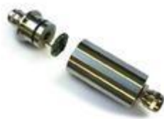
ILE Stainless steel enclosure for DCell data converters and ICA