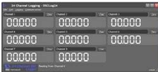
24 Channel Logging View and log up to 24 channels.