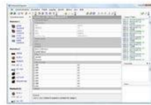
Instrument Explorer Quick set up software event monitoring, data logging, calibration and configuration.