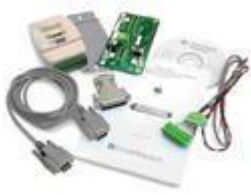
EVAL KIT Evaluation kits for DCell and DSC are available for stress free set up. Strain gauge data converter to RS232. Modbus, CAN, RS885