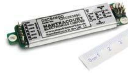
DSC Card version strain gauge data converter to RS232. Modbus, CAN, RS485