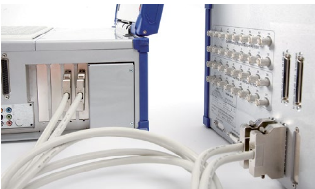
Extra 32 channel signal conditioning to expand a 16 channel instrument to a total of 48 channels