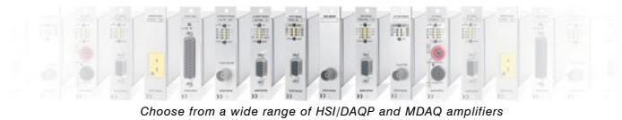
Choose from a wide range of HSI/DAQP and MDAQ amplifiers

For quasi-static PAD series isolation amplifier modules the data is output via RS-485 or RS-232. Mixed HSI/DAQP/PAD configurations are supported.