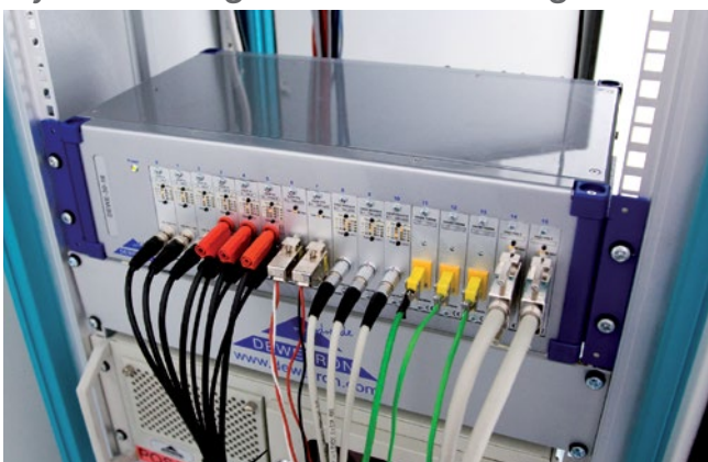
Signal connection to HSI/DAQP modules