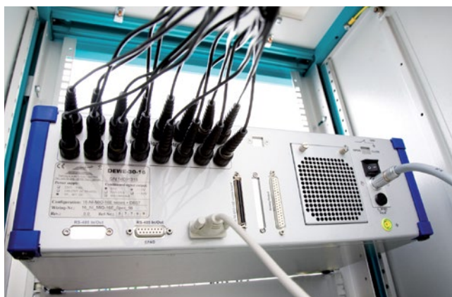
Conditioned signal output \pm 5 V or \pm 10 V to an A/D card, control or SPC